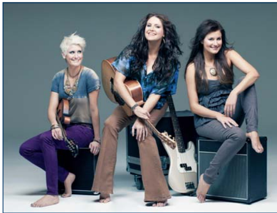
The McClymonts appearing at the Nautilus Theatre 21st March at 8pm Tickets from the Theatre Tel: 8683 5088

Since joining forces five years ago Brooke, Samantha and Mollie McClymont have taken the country music world by storm. With their exquisite three-part harmonies, soaring vocals and stunning onstage presence, it's not surprising that The McClymonts have become the hottest recording and touring act in Australian country music and are fast becoming the talk of the industry in the U.S.A.