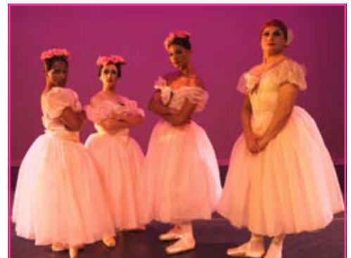
'Men in Pink Tights' Monday 26th March at 8pm

"ARTISTICALLY BRILLIANT, ABSOLUTELY HILARIOUS" The New York Post